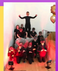
Made with PosterMyWall.com