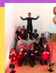
Made with PosterMyWall.com